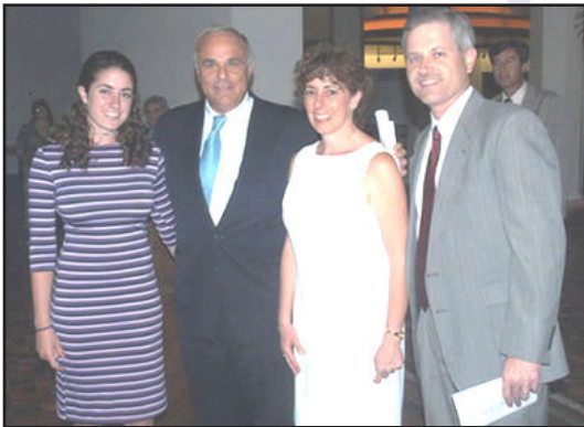
Pennsylvania Parents of the Year 2003